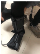
Lower leg & foot