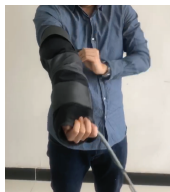
Upper & lower arm