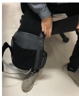
Upper & lower leg